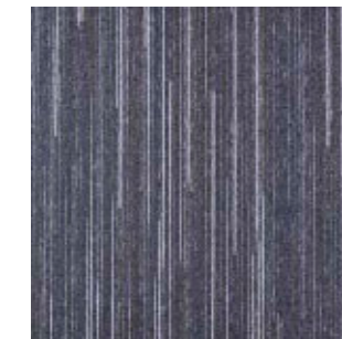
LINX - 49760