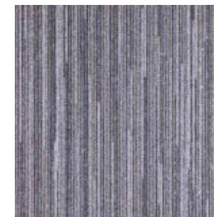
LINX - 49740