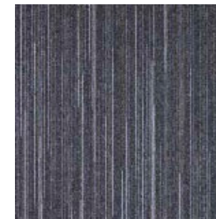
LINX - 49750