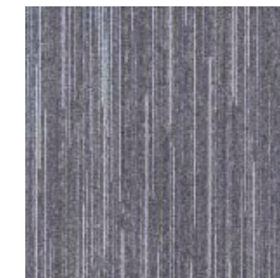
LINX - 49742