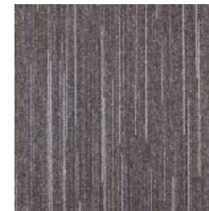
LINX - 49730