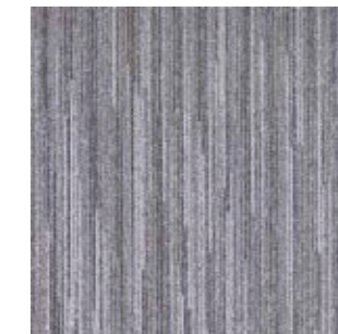
LINX - 49720