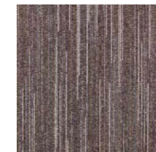
LINEA - 40130