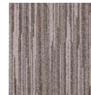
LINEA - 40120