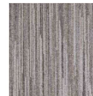
LINEA - 40140