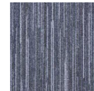
LINEA - 40160