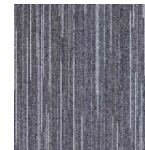
LINEA - 40150